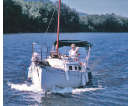
Outerbridge and Tucker underway aboard Dart .

Morgan admitted to doing plenty of research and encouraged first-timers to do the same. "Don't take it lightly," he said. "There are bits and pieces of advice that you need to tailor to your conditions depending upon the type of boat you are using." He described his Great Loop adventure as a "combination of a destination and a journey" limited to a three-month travel window. "It was a destination in what to accomplish with day-to-day goals, while it was a journey to see the countryside. I took a different approach with the type of boat I used ... it was more of an out-there experience."