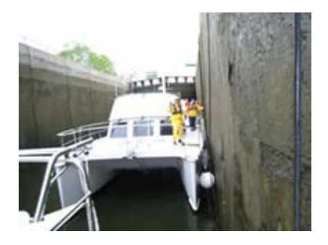
Locking through in the rain