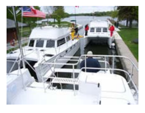
All 3 PDQ's fitting in one lock

As we cruised the short distance between this set of locks we encountered another swing bridge that had to be opened for the three of us as we are now back together. By 3:00 pm we had gone through locks 22, 23, 24, 25, and 26.