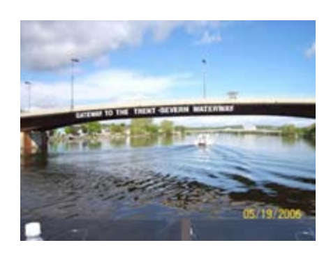
Gateway to Trent Severn

It was only a short distance to the first lock. The lock fees of $153.00 per boat for a one-way pass through the Trent Severn were prepaid so we just needed to pick up our stickers. There are 43 locks on the 240-mile waterway known as the Trent Severn which was completed in the 1920's. The first 33 Locks have a combined lift of 590 feet. The western ten locks lower the boat 256 feet.