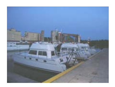
Midland Marina on Georgian Bay at daybreak

After passing thru the Etang Gloucester Pool we encountered Port Severn Lock 45, our last one for this trip. We traveled another hour and a half and found three slips just beckoning us at the Midland Marina. After a short shopping trip to this highly decorated town with murals painted on many of the buildings, we enjoyed a meal prepared by the cook on PDQ 34-88, our host and leader.