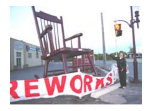
Victoria Day in Peterborough