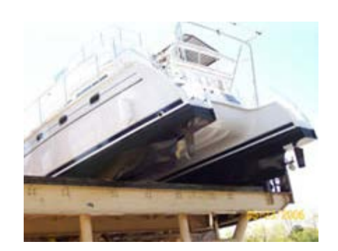
PDQ placement on rail care

The PDQ catamaran's twin hulls with the keel about 12 feet apart can sit very stable on its bottom. Because the four cylinder engines are placed low in the hull, the shaft and propellers are straight out the vertical edge of the keel and well protected. The railway personnel lowered the railcar into the water and we maneuvered our boat onto the railcar deck with the aft hull hanging slightly over the rail bed. Even though we explained the props are high enough to be protected, they still felt safer in having it hang over the back edge of the rail car.