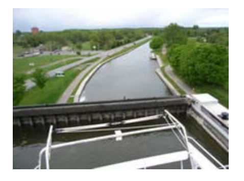
View at the top looking back

A passage of a couple hundred yards brought us to Lock 21, the Peterborough Lift Lock. This lock was as fascinating as people had said it was. It consists of two side-by-side tubs each approximately 150 feet long by 40 feet wide with hydraulic gates at each end. We entered the right tub and tied to the rails strategically place in the tub. Once we were in the tub and the rear gate was closed and locked. The hydraulic valve was then released and the upper left tub which has had 18" of water added and is