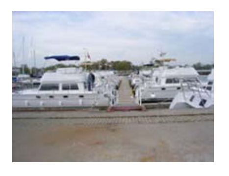
Overnight at Cobourg, Ontario

PDQ provided a wonderful catered homemade meal at the Cobourg Yacht Club. PDQ owners Deb & Simon Slater drove from Whitby to be with our group. After the group split up for the evening we walked through a section of the beautiful, clean town of 18,000, which is one block from the expansive marina.