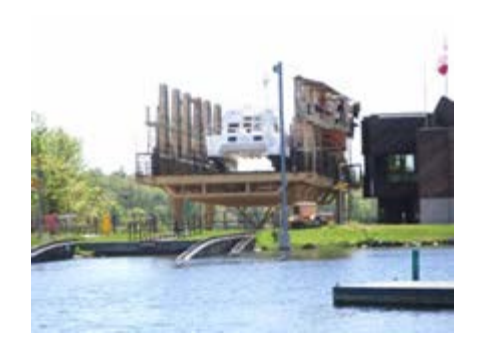
Being lifted on the rail bed

The PDQ catamaran's twin hulls with the keel about 12 feet apart can sit very stable on its bottom. Because the four cylinder engines are placed low in the hull, the shaft and propellers are straight out the vertical edge of the keel and well protected. The railway personnel lowered the railcar into the water and we maneuvered our boat onto the railcar deck with the aft hull hanging slightly over the rail bed. Even though we explained the props are high enough to be protected, they still felt safer in having it hang over the back edge of the rail car.