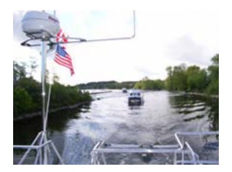
Navigating the Trent River