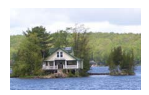
Home on a rock island

Clearing Lock 27 at Young's Point, we entered Stony Lake, a large lake with a number of beautiful homes along the shoreline and on islands. It was interesting to note that Canada is experiencing the same housing pressure we experience on waterfront properties in Michigan and Wisconsin. Cottages are being purchased for a hefty price, torn down, and replaced with large modern homes.