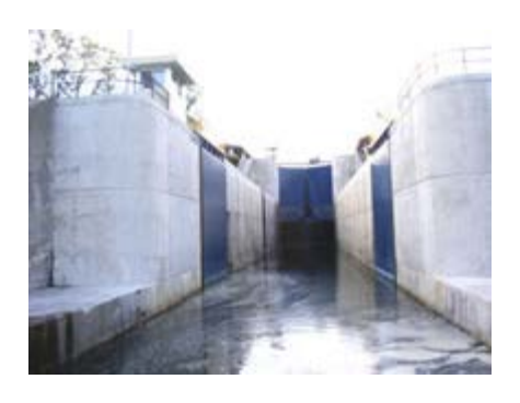
Entering a flight lock

The first six locks are rather close together and we completed them just past noon. It was a beautiful sunny, jacket-weather day. The next six locks were spread out over a 20-mile stretch. Some areas were lined with cottages and homes near the water. One very narrow section was marshy and other sections were lined with tall trees.