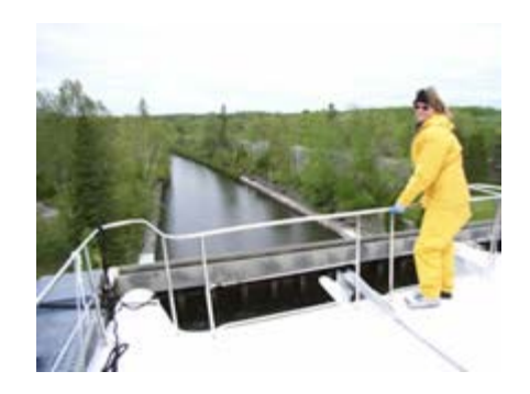
Top of Kirkland Lift Lock at 49 feet

Our next lock was the Kirkfield Hydraulic Lift Lock 36, the world's second largest lock of this type, with a lift of 49 feet. In the Peterborough Lock we were the last one in so we had the view to the river below as we went up. In this lock we are the first one in and the lock is at it's highest level so now it looks like there is nothing in front of us and if that forward gate failed we would be in for quite a ride...eerie feeling!!