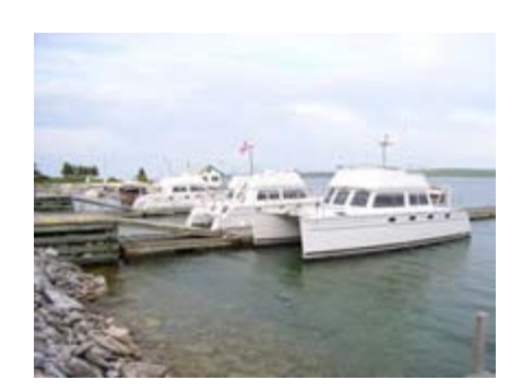
Muldrum Bay Marina