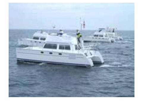
15 PDQ 34's cruising Lake Ontario

Arriving at Cobourg, we gradually filled up two piers as the 15 PDQ's tied up side by side. It was a very impressive site indeed.