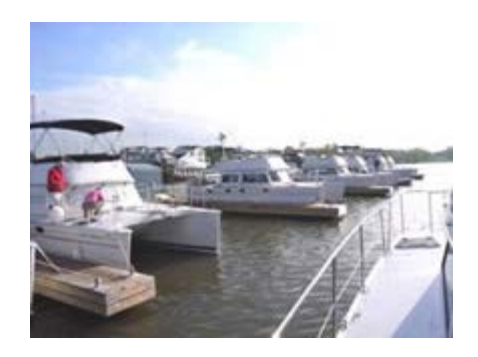
15 new PDQ 34's at Whitby, Ontario

This adventure began upon our arrival at the Whitby Marina in Whitby, Canada, as 15 excited couples moved into their new PDQ 34 Power Catamarans, most seeing them for the first time.