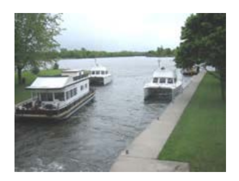
Waiting at Lock 20

We pull away from our slips at the Peterborough Marina in a light rain and very chilly air. Locks 20-26 are located very close together so we will spend a good part of our day getting through these. There are already several other smaller boats and a large houseboat waiting at the gate for Lock 20.