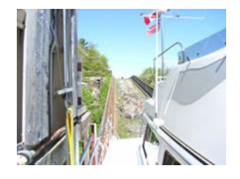
View looking back

contraption states that the Marine railway was the lowering conveyance of choice because the authorities did not want the lamprey eel to get into Georgian Bay and the Upper Great Lakes. The St. Lawrence Seaway was opened in the 1960's and sure enough the lamprey got into the lakes even though the people of 60 years ago had tried to prevent that.