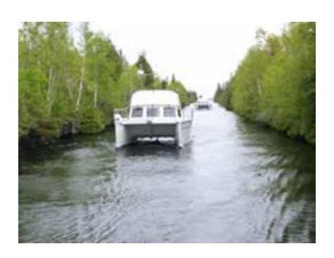
Narrow tree-lined channels