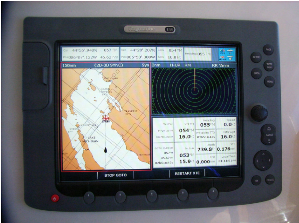
Chartplotter showing our course, radar, and navigational info

Besides having our paper chart spread out, we monitor our course and position on the single 12" chartplotter/radar installed on this boat. We set the optional screen layout with the chartplotter on the right and the radar and navigational info on the left.