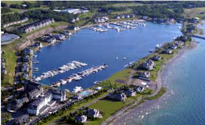
Bay Harbor Marina bottom left

The transformation was rapid. In 1994, simultaneous explosions demolished the cement plant smokestacks. Eight months later, the barrier between Bay Harbor and Little Traverse Bay was removed, and water rushed in at the rate of one-million gallons per minute. Within 24 hours, over 2.5-billion gallons of water formed the new Nautical Center of the Great Lakes and became Bay Harbor Lake.”