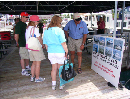
Looking at other in-stock models

The show ends at 3 pm on Sunday. We listen to the weather forecast to determine when it is best for crossing Lake Michigan. The forecast for Monday is for winds to increase to 15-20 knots with a 60% chance of thunderstorms. Looks like it would be best for us to head out as soon as we can. Even though we probably have plenty of fuel to cross, we plan to run in to Charlevoix to fill-up. A good rule of thumb is to have as much fuel as your tanks hold to head across a lake the size of Michigan that can turn nasty in short order. It doesn't take long at all to get to Charlevoix because it is only 20 some miles south of Bay Harbor.