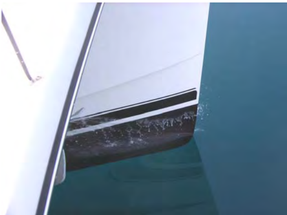
Bow wake at 17 knots

If you've ever wondered why catamarans get such great fuel economy, this picture of the bow wake at 17 knots tells the story. The catamaran hulls simply knife through the water with very little resistance.