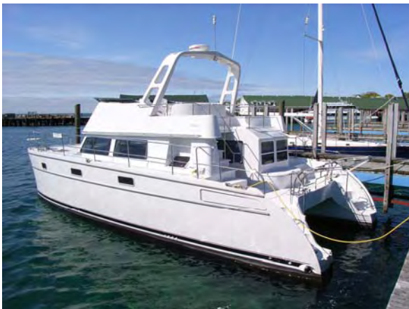
PDQ 41 Power Catamaran

Regarding our decision as to which boat to take, initially we need to pick one that has the electronics installed. We don't feel it is safe to venture across Lake Michigan without a good radar system, compass, and VHF radio. A GPS chartplotter and the auto-pilot are extra conveniences that make the trip more enjoyable and less stressful. We also want to vary the boats we take so as to give exposure to the many different models we sell. This year we chose the PDQ 41 Power Catamaran. This is the first vessel of its kind to be in the Great Lakes.