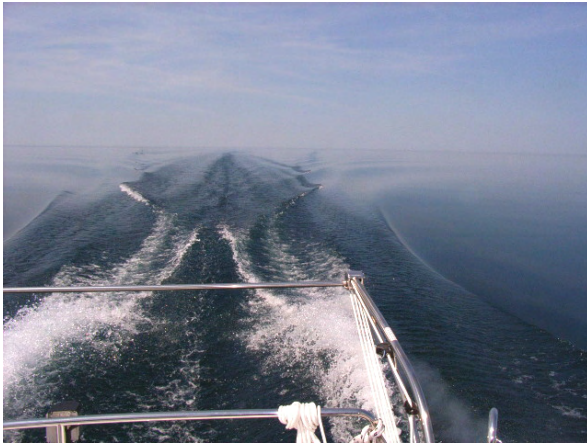
Stern wake at 17 knots

Generally speaking, even if the Lake is very calm in the morning, by noon the waves will pick up as the winds usually do. That doesn't happen as you can see on this picture. You can hardly tell where the lake ends and the sky begins. We have crossed this lake over 70 times and have NEVER had it stay flat the whole way as it is on this magical day!