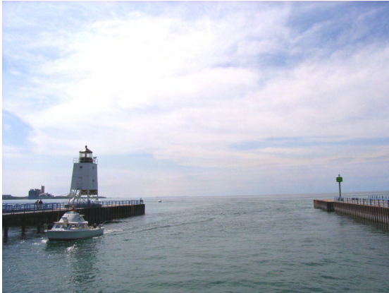
Leaving Charlevoix harbor

scheduled bridge opening times. Soon we're fueled up and head out on the lake which is still treating us to calm seas at 1-2 feet.