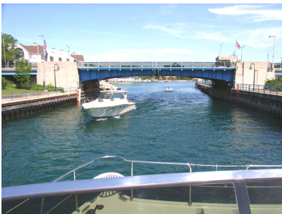
Low bridge entering Charlevoix

The show ends at 3 pm on Sunday. We listen to the weather forecast to determine when it is best for crossing Lake Michigan. The forecast for Monday is for winds to increase to 15-20 knots with a 60% chance of thunderstorms. Looks like it would be best for us to head out as soon as we can. Even though we probably have plenty of fuel to cross, we plan to run in to Charlevoix to fill-up. A good rule of thumb is to have as much fuel as your tanks hold to head across a lake the size of Michigan that can turn nasty in short order. It doesn't take long at all to get to Charlevoix because it is only 20 some miles south of Bay Harbor.