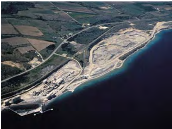
Former cement plant at Bay Harbor

As we enter Little Traverse Bay, the cliffs of Bay Harbor are prominent as are the beautiful expansive homes that dwell on them. This harbor was created from an abandoned cement plant. I have included the aerial pictures and the write-up from the Bay Harbor website at www.bayharbor.com where you can find even more information.