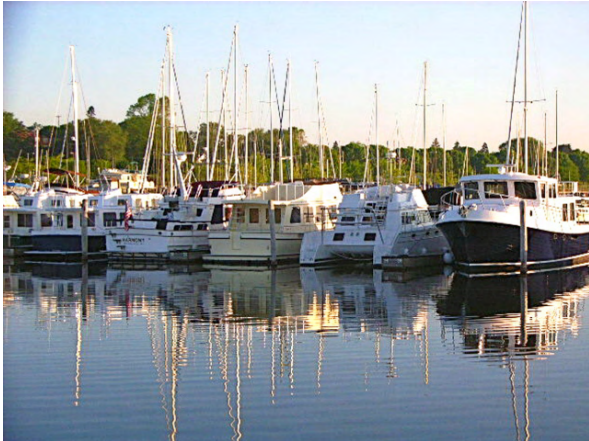
American Tugs, Camanos, and PDQ's at Manistowoc Marina

The show takes place on Friday, Saturday, and Sunday. Our plan is to cruise across Lake Michigan on Thursday and return on Monday. As the days approach, we start watching the weather very closely and are prepared to leave a day earlier if we have to. This year, the forecast is favorable for Thursday but we like to get an early start before winds get a chance to build. Since we live a half hour away from the boats, we generally get everything loaded on the boat and spend the night there so it's easy to take off at the first sign of daylight.