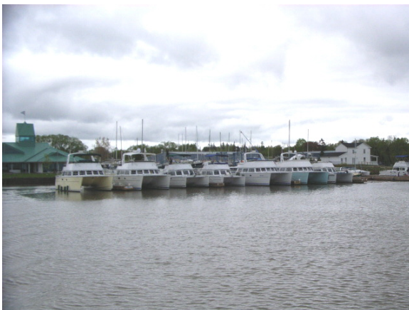
PDQ 41's and 34's at Whitby Marina

The boat handling classes are always well received as the men and women are separated. A female captain who makes the experience less threatening instructs the women and each person is allowed a chance at the helm to dock and undock the boat. This is a big catamaran but it handles beautifully. The new electronic controls operate so smoothly you can actually control both engines with one hand. With one engine in forward and the other in reverse, it will turn a tight circle.