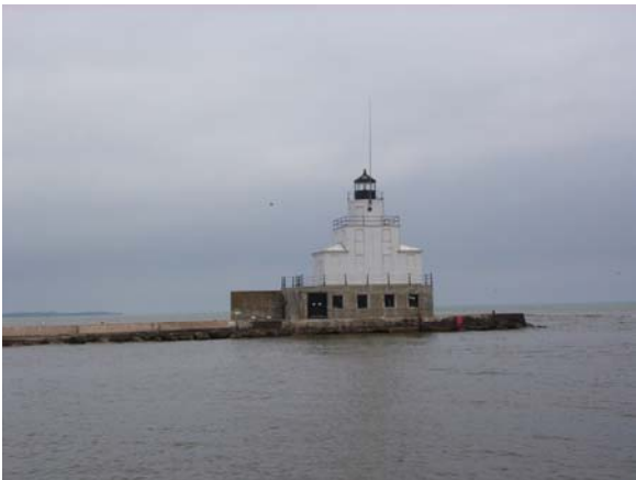
Lighthouse welcoming us home at Manitowoc, Wisconsin

What a spectacular view as we left Mackinac Island at sunrise. Day 6 turned out to be another day like the others with 1-2 foot seas and very light winds as we cruised southwest on Lake Michigan past Beaver Island and through the Manitou Passage and across the lake to Manitowoc. Temperatures during this whole trip hovered in the 40's at night and never much over 55 during the day. We ended up running from the lower helm most of the time, but that's just not a problem in this boat. The visibility is almost 360 degrees and with all the big windows, you always feel very much a part of your surroundings. Ken and I generally do a lot of reading on a trip like this as we take turns at the helm.