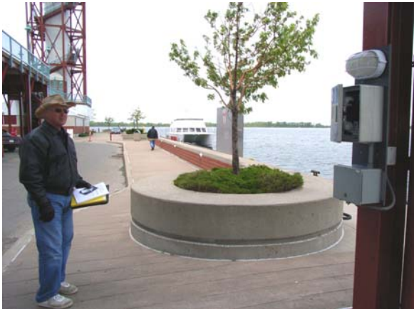
Tied up on pier at Dobbin's landing – Customs phone on right

We arrived in Erie at noon spotting the lighthouse at the end of the Dobbin's Landing pier. An easy tie up on the wall of the large stationary pier made it easy to go ashore to the US Customs phone located on the pier.