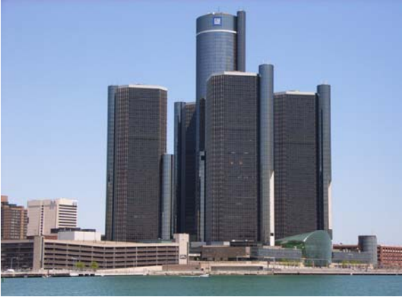
GM Headquarters in Detroit, Michigan

Across the river from Detroit is the city of Windsor, Canada. For a good trivia question, it is the only Canadian city south of the United States. It is well known for its 900 parks within the city boundaries.