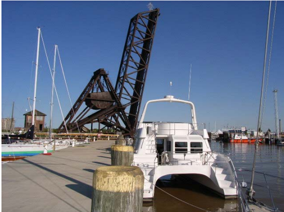
Port Huron Yacht Club near old bridge

and catch up on what's been going on in our lives. He was the first commodore of the yacht club and raced sailboats for many years until his knees gave out and he had to switch to a trawler.