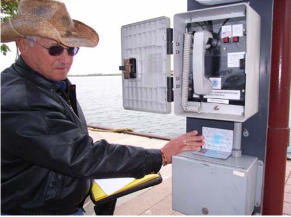
Customs taking picture of passport

It has been updated since we were here last and now has a camera that takes your picture as well as a picture of your passport. All persons on board are photographed. It really feels weird because you are told to stand in front of the phone and look straight ahead. They have a camera in there somewhere. This is also where we need the number from our Decal that I mentioned earlier that we purchased before hand. That process all went very smooth and we were soon underway again. Lake conditions remained the same so we were really making good time. We passed Cleveland, Ohio, noting all the skyscrapers from a distance.