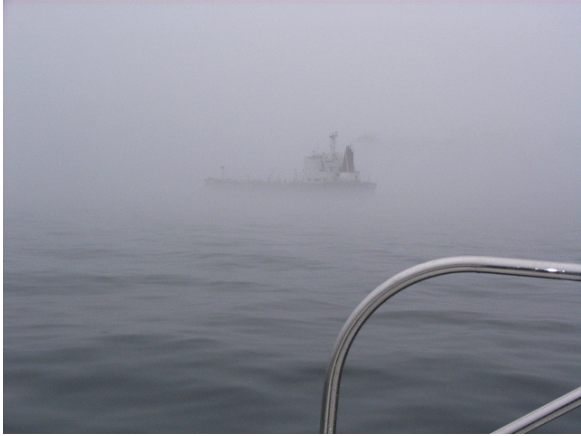
Encountering a large freighter in fog

The camaraderie is always great too as we socialize with the other catamaran owners and the staff of PDQ Yachts. Saying our thank you's and good-byes, we cruised out of Whitby midmorning on Wednesday, May 16 th , and headed south on Lake Ontario for Port Weller and the start of the Welland Canal. About halfway across the lake we encountered really thick fog. Setting the range on the radar at ½ mile we felt we could keep a safe distance from any obstacles.