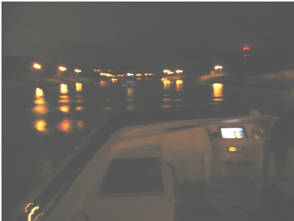
Running the canal after dark

Lock 8 is only a 5-foot rise in elevation so we didn't even have to tie up...just hovered in the middle until the gate opened. It was now after 11 and we had a 15-mile run in the dark so we kept our cruise at about 9 knots. It was lighted pretty well along the sides so we could always see that we were in the channel. We still kept a vigilant watch on the depth sounder.