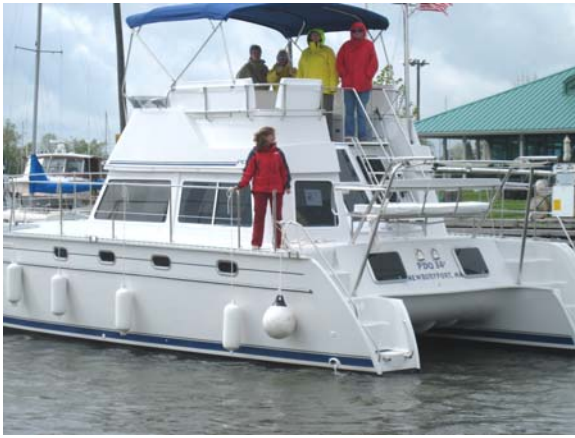
Boat handling course for women at PDQ U

Spending two days at the PDQ University was very helpful as we learned the details of the electrical system and helpful hints and suggestions to get the most out of the electronics package installed on the boat. A presentation by representatives from Yanmar Diesel Engines and Northern Lights Generators was interesting and informative.