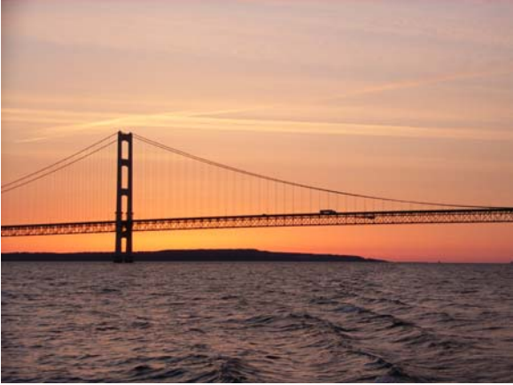
Mackinac Bridge at sunrise

What a spectacular view as we left Mackinac Island at sunrise. Day 6 turned out to be another day like the others with 1-2 foot seas and very light winds as we cruised southwest on Lake Michigan past Beaver Island and through the Manitou Passage and across the lake to Manitowoc. Temperatures during this whole trip hovered in the 40's at night and never much over 55 during the day. We ended up running from the lower helm most of the time, but that's just not a problem in this boat. The visibility is almost 360 degrees and with all the big windows, you always feel very much a part of your surroundings. Ken and I generally do a lot of reading on a trip like this as we take turns at the helm.