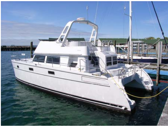
PDQ 41 Power Catamaran

As we mentioned last month in our article about "Trawlers on the Move", we would be taking delivery of our new 41 PDQ Power Catamaran at the factory in Whitby, Ontario and cruising her back to Wisconsin via the Welland Canal and four of the Great Lakes.