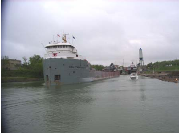
Large freighter coming out of Lock as we enter

We finally reached Lock 7 at 9 pm, which is when Fred left us. Two freighters, each locked through separately, came through before we were allowed to go in.