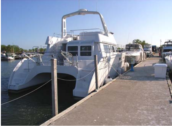
Tied up at Spitzer Lakeside Marina in Lorain, Ohio

A very nice restaurant within walking distance was recommended by the locals so we took their sound advice and enjoyed a pleasant dinner and evening.