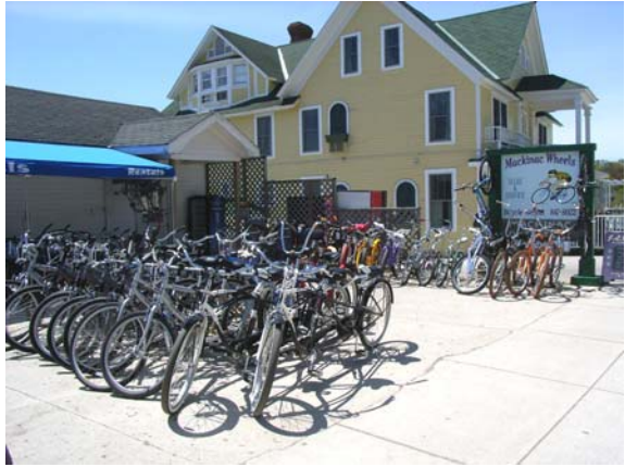
Bicycle rental shop on Mackinac Island

Church and we attended the 8:30 service in the morning. Then a block from the church was a bike rental shop (only one of dozens in the area).