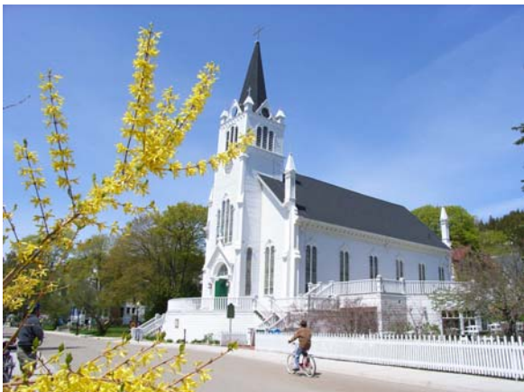
St Ann Church, Mackinac Island

Entering Mackinac Island in a drizzling rain doesn't really take away from its charm and uniqueness. We picked a slip and backed in since all the pier heads were pretty short. There aren't many boats in the water because it's so early in the season, but the ferryboats are buzzing back & forth getting folks from the island to the mainland, some visitors and some workers that don't live on the island. Since the rain is continuing, we ate on board and just relaxed taking in the scenery around us.