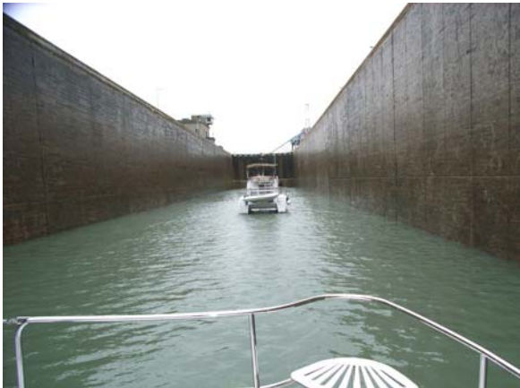
Entering Lock 1 – PDQ 34 ahead of us

Having that taken care of, we decided to have a sandwich and do some reading as we passed the time. We entered Lock 1 at 4 pm at Mile 0.