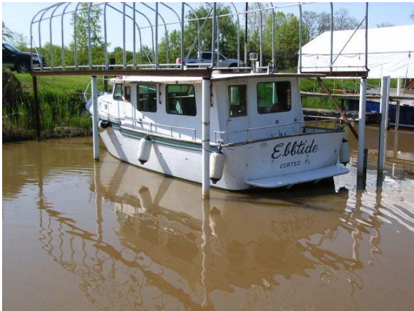
40' Vinette Steel Hull Trawler

Arriving in Port Huron around 4 pm gave us plenty of daylight before we needed to find a dock so we cruised up the Pine River to River's Bend Marina where a 40' Vinette steel hull boat that we are brokering is located. We've not seen the boat other than pictures and it's always a good idea for us to be able to board the boats we are selling for the owner. A gal at the marina was very helpful in directing us to their location. The river is very narrow and we're mostly showing 3-4 feet on our depth sounder. Bringing a brand new boat into an unknown area like this is pretty intimidating. Julie continues to reassure us that we'll be OK.