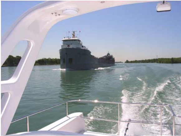
Passing freighters on the Detroit River

Friday dawns with another beautiful day and calm seas with waves 1-2 feet. We soon spot the large ferris wheel at Cedar Point amusement park near Sandusky and cruise past Kelleys Island, well noted for its restaurants and night-life. Before long we are entering the Detroit River, meeting and passing a lot of big freighters. Their immense size at such a close distance is really impressive.