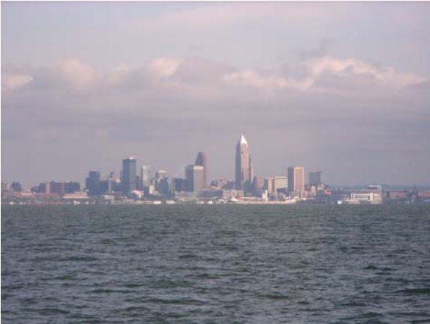
Cleveland, Ohio from a distance

It has been updated since we were here last and now has a camera that takes your picture as well as a picture of your passport. All persons on board are photographed. It really feels weird because you are told to stand in front of the phone and look straight ahead. They have a camera in there somewhere. This is also where we need the number from our Decal that I mentioned earlier that we purchased before hand. That process all went very smooth and we were soon underway again. Lake conditions remained the same so we were really making good time. We passed Cleveland, Ohio, noting all the skyscrapers from a distance.