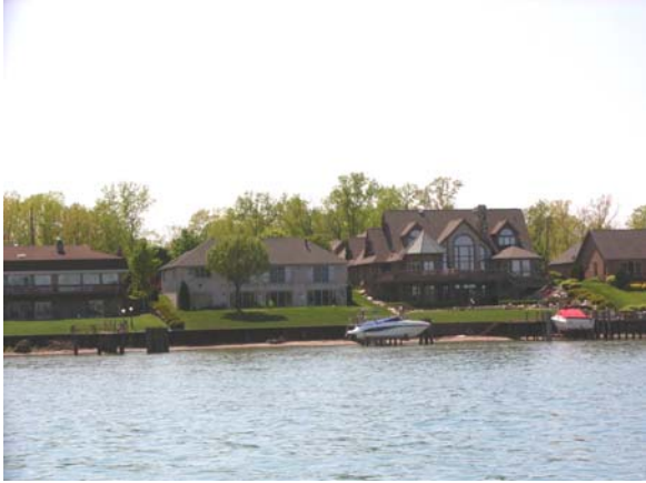
Homes along the St. Clair River

Arriving in Port Huron around 4 pm gave us plenty of daylight before we needed to find a dock so we cruised up the Pine River to River's Bend Marina where a 40' Vinette steel hull boat that we are brokering is located. We've not seen the boat other than pictures and it's always a good idea for us to be able to board the boats we are selling for the owner. A gal at the marina was very helpful in directing us to their location. The river is very narrow and we're mostly showing 3-4 feet on our depth sounder. Bringing a brand new boat into an unknown area like this is pretty intimidating. Julie continues to reassure us that we'll be OK.