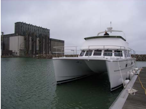
Docked at Port Colborne