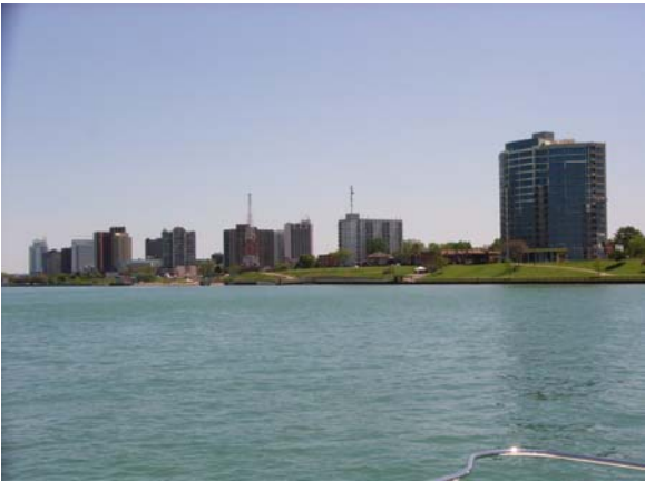
Windsor, Canada across the river from Detroit

Across the river from Detroit is the city of Windsor, Canada. For a good trivia question, it is the only Canadian city south of the United States. It is well known for its 900 parks within the city boundaries.