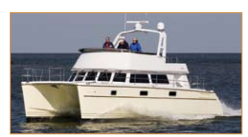
PDQ Power Cat 41 & 34

THE PLACE TO SHOP FOR IN-STOCK TRAWLERS & CATAMARANS AT ONE LOCATION