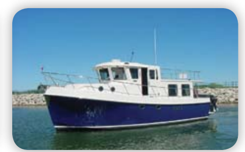
American Tug pilothouse trawler

Having said that, American Tugs has been in production for many years and has recently added a flybridge option. This came about as a strong demand for the flybridge from the Florida market. We recall a conversation with one of the manufacturers from the Northwest who said he thought that folks there ran about 70% from the lower station and only 30% from the bridge. Another person from Florida said they run 70% from the bridge and 30% from the lower station. It really changes depending on what part of the country you do your boating.