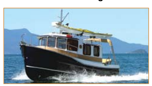
Ranger Tug 25 & 21 Trailerable