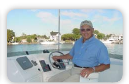
By noon it's sunny & warm

The sun is getting up higher (10:20 am) now and the time has come to head back down and change into different clothes to take advantage of the sun's warmth.