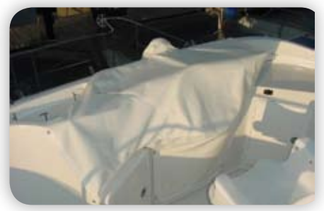
Canvas covers to protect electronics