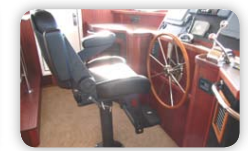
Comfortable captain's chair