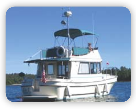
Bimini gives sun-protection

on the outside patio the discussion turned to the pending flybridge enclosure. We reasoned that if it would have been windy the extra windage added by all that canvas would have made our landing a different story. But if we don't add the enclosure, we should really consider a bimini. With all the warnings about skin cancer, it could be a great addition.