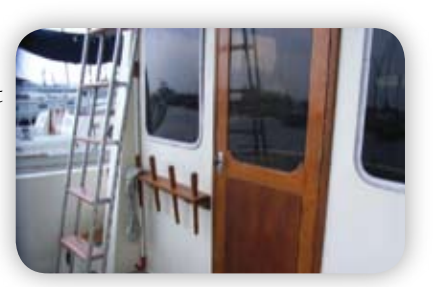
Vertical steps to bridge

openings if you are in a high road traffic area and you may end up waiting a half hour or more. Other bridges will open on demand. It can be a great advantage to be able to cruise right through without waiting for a bridge tender.