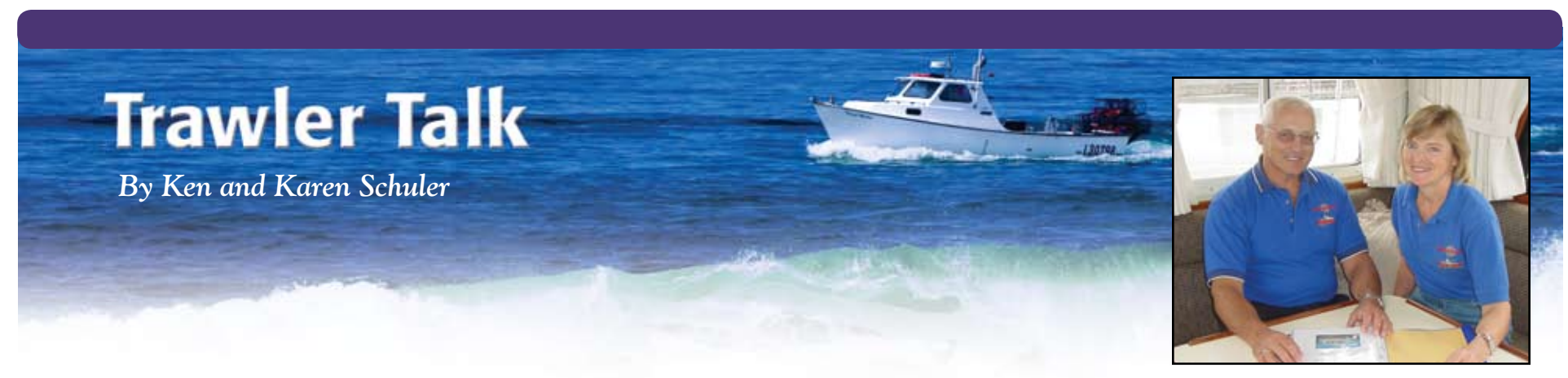
"FLYBRIDGE OR PILOTHOUSE TRAWLERS"

As a boat dealer selling live-aboard, long range cruising trawlers, we often hear comments like, "I have to have a flybridge" or the opposite, "I much prefer a pilothouse boat". As part of growing our business and adding more choices, we have intentionally taken the dealership for both flybridge boats and pilothouse boats. The Camano and PDQ Power Catamaran trawlers both feature flybridges, whereas, the American Tugs and the Ranger Tugs are pilothouse trawlers.