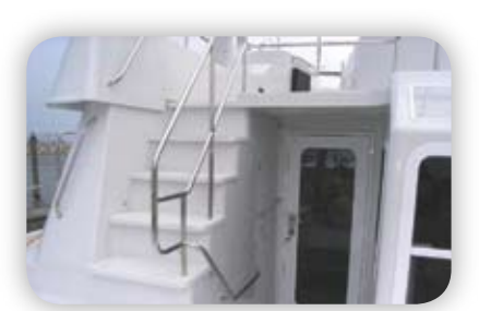
Easy-walking steps to bridge

The water is calm and the 360 degree view is great! There's a bridge coming up and being right on top sure makes it easy to see if we can squeeze under. A flybridge does add considerable height to any boat and must be considered when bridge clearance is an issue. The pilothouse trawlers without a bridge usually have 10 to 12 feet of height whereas a flybridge trawler will be 14 to 16 feet or greater. Many bridges have scheduled